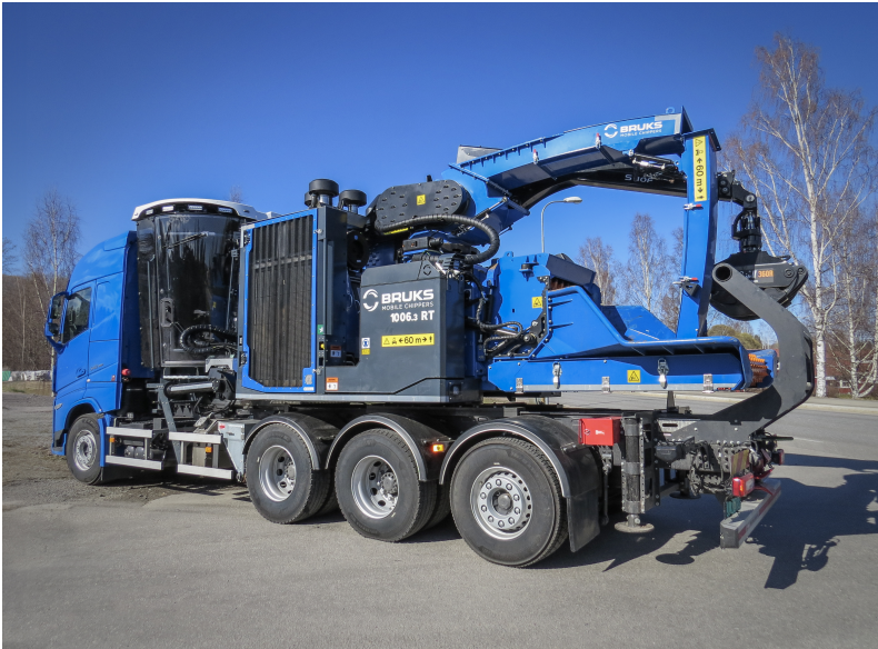
MOBILE CHIPPER 1006.3 RT