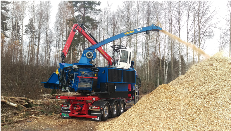
MOBILE CHIPPER 806.3 ST