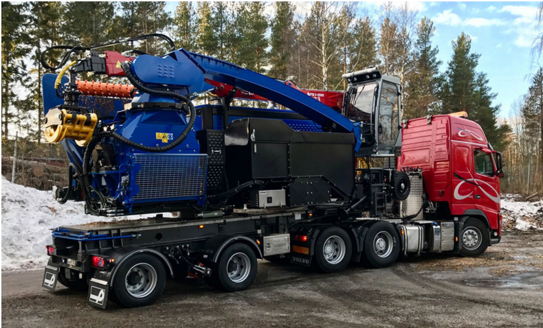
MOBILE CHIPPER 1006.2 ST