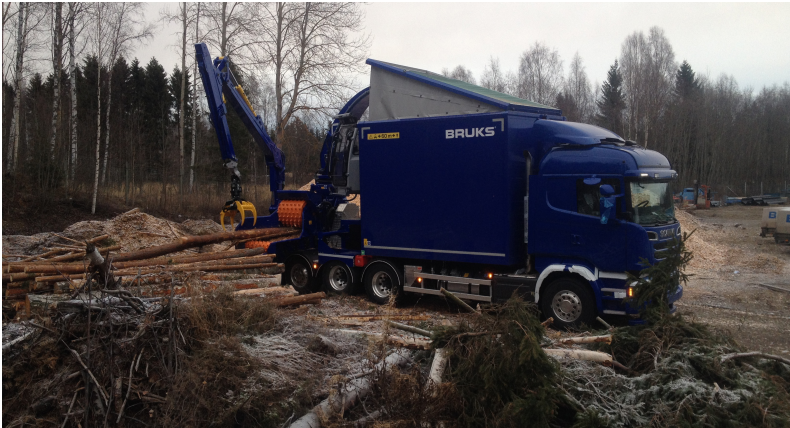
MOBILE CHIPPER 806.2 PTC TRUCK