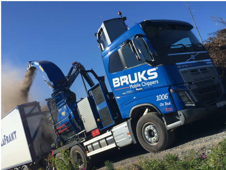
MOBILE CHIPPER 1006 PT TRUCK